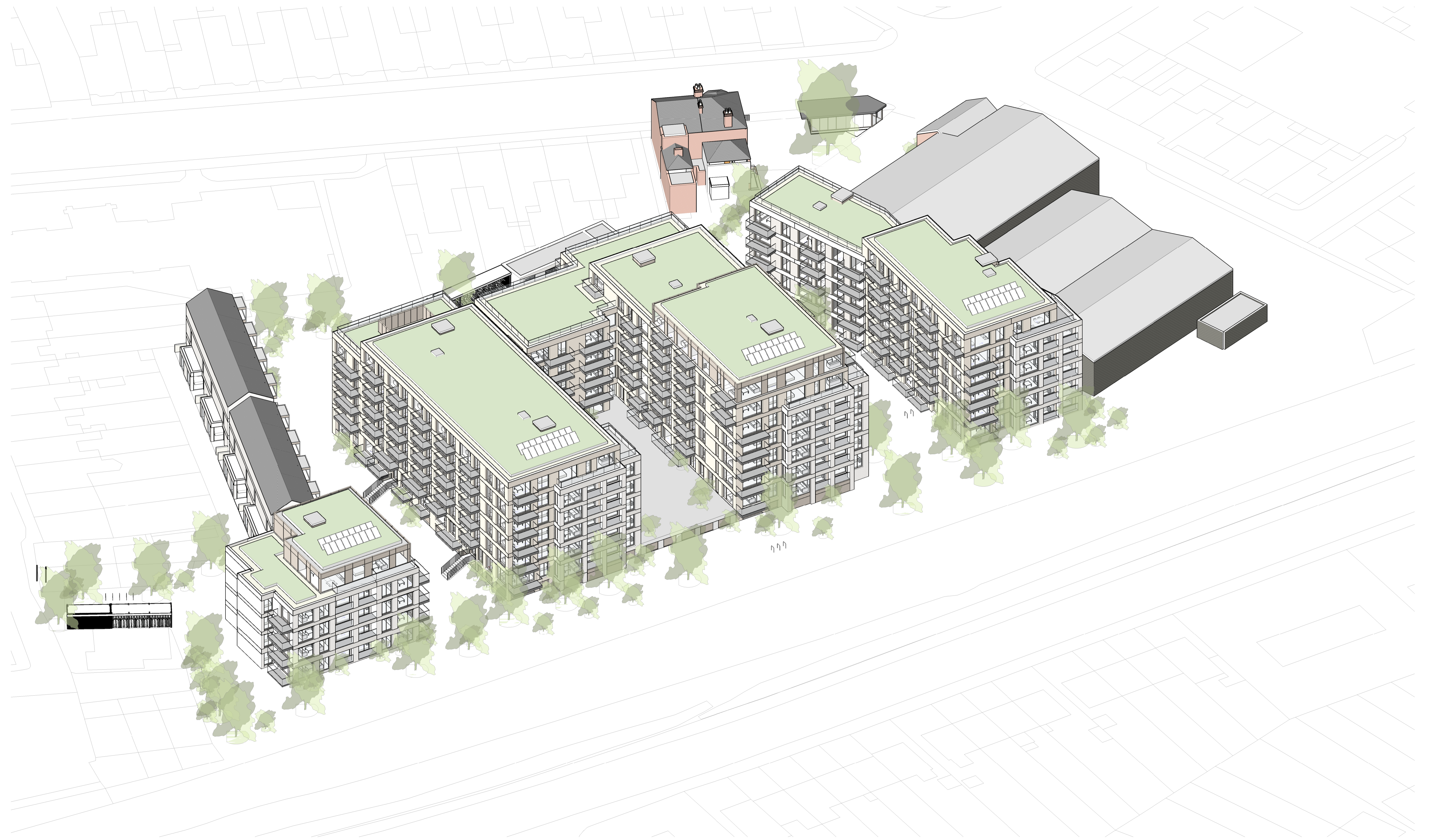
Axial View - South West